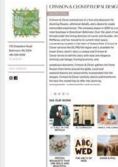
Enhanced Vendor Listing